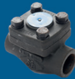
Valve Forge Check Valve