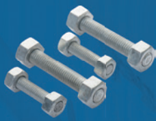
Stud bolt Electrogalvanized