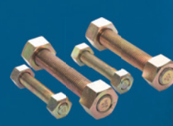
Stud bolt Yellow Bi Chromate