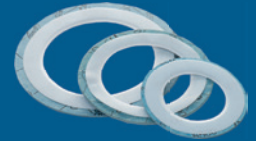
Gasket PTFE Envelope