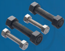
Stud bolt Carbon and Stainless Steel