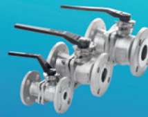
Valve Cast Ball Valve