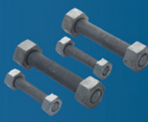
Stud bolt Hot dip galv