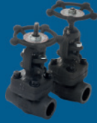
Valve Forge Gate Globe