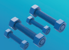
Stud bolt PTFE Xylan Blue