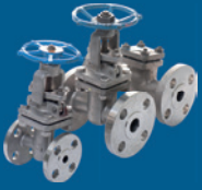
Valve Cast Gate Globe Check

Includes Gate, Globe, Check, and Ball Valves for industrial use.